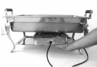
STEP 2 – Figure 2

STEP 1 – Place Top Plate (Part B) with magnets facing down at desired location inside of water pan. See Figure 1.