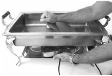
STEP 5 – Figure 3

STEP 4 – Allow the water in the water pan to cool completely.