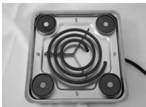
Part A Burner Body