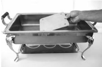
STEP 1 – Figure 1

STEP 1 – Place Top Plate (Part B) with magnets facing down at desired location inside of water pan. See Figure 1.