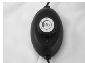
Part C Controller